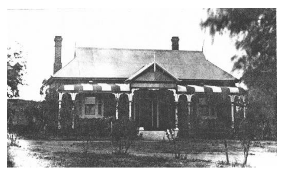
Glen Park early photo, note striped verandah roof