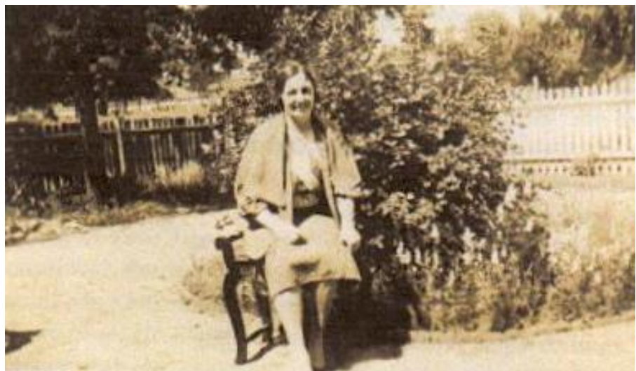
Wife of reverend Paine about 1936 showing white picket front fence, which extended past front of the adjoining church block. Ironbark slabs on post and rail fence on N boundary have been retained in recent (c2005) fence reconstruction by George Walker.