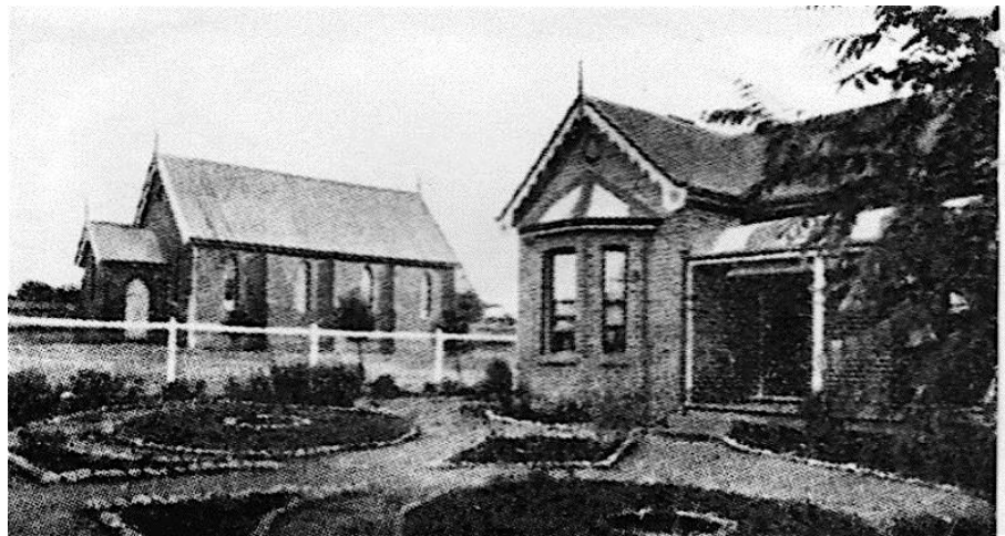
Early photo of Parsonage with Methodist church in Background