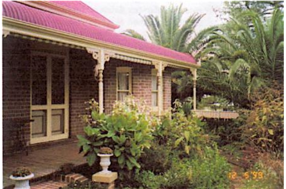
Front verandah and front of new office